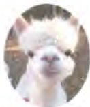
Alpacas from Six Paca Farm