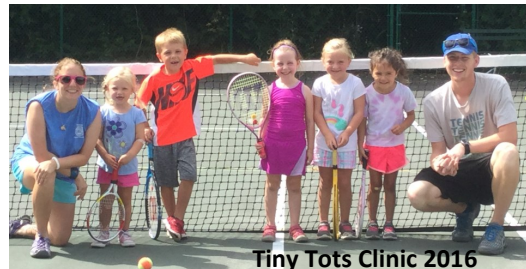
Tiny Tots Clinic 2016

Fee: $45.00 City Residents / $60.00 Non-residents